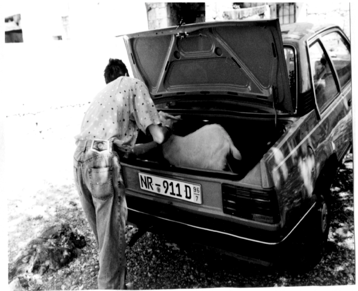
Goats were transported in the trunk of our car...