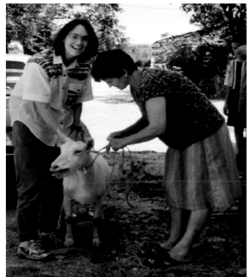
...and delivered to refugee families.