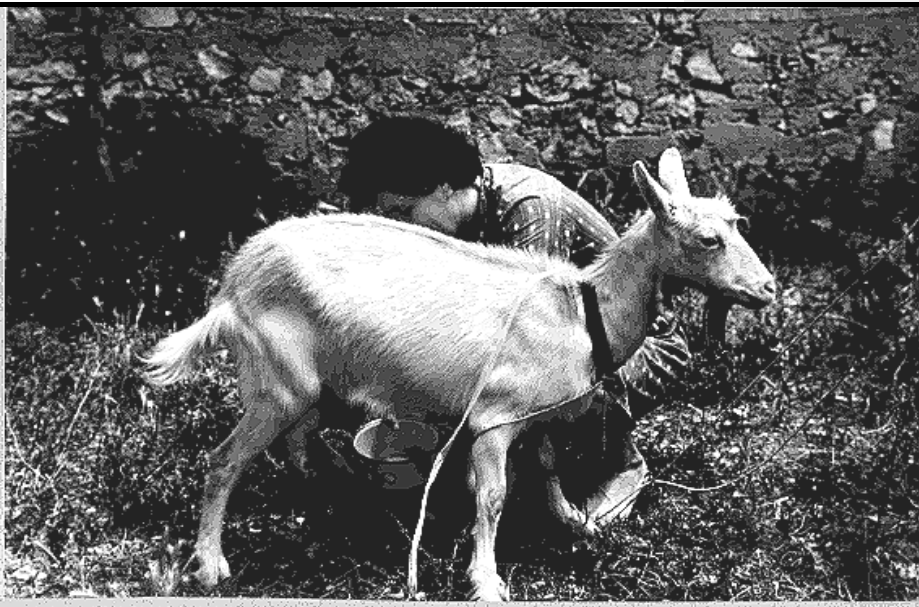
Goats are easy to maintain and they provide precious milk.