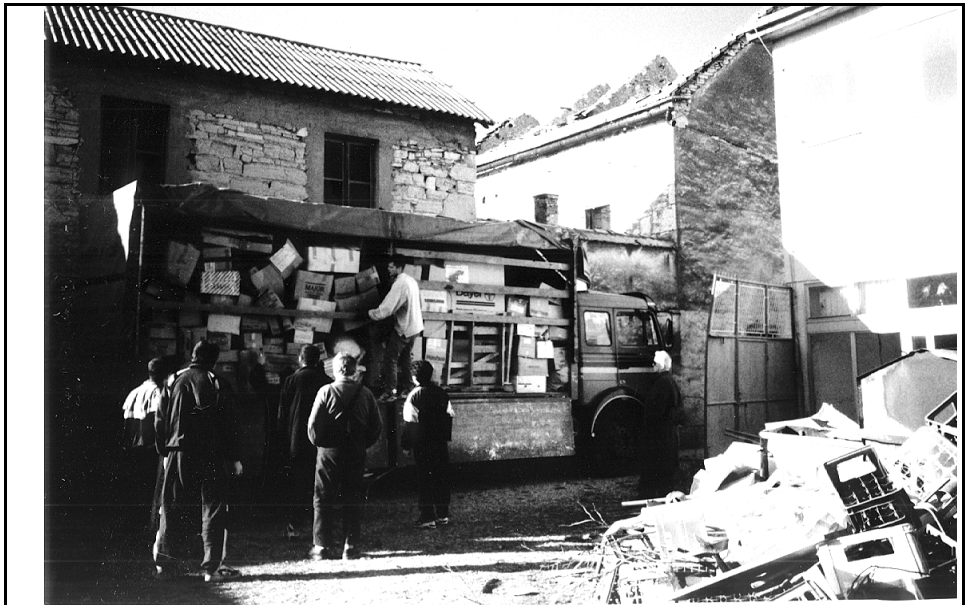
Your donations of food boxes and supplies being delivered to refugee families in Kistanje, Croatia.

If each of you, who receives this newsletter, identifies just one item to send in November and asks a friend to do the same, we will be able to fill another container and continue helping these wonderful families.