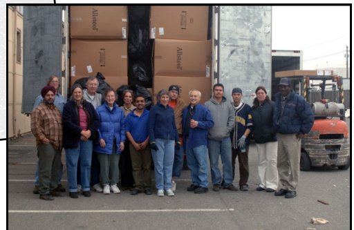
It takes a lot of hands...