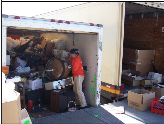
When the truck is full it brings it's load to the recycling center in Benicia where it will be unloaded. The items are separated and distributed to non-profit organizations by employees of the East Bay Depot for Creative Reuse.