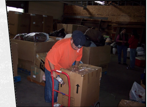
As many years as we've been doing this, we still are amazed at the wonderful people who volunteer their time to help get these shipments loaded. It is such a pleasure to be associated with these generous individuals.