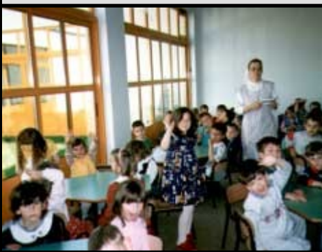
The school for the orphans is also available for the local community. Many families send their children there because of the loving care and it's high academic standards.