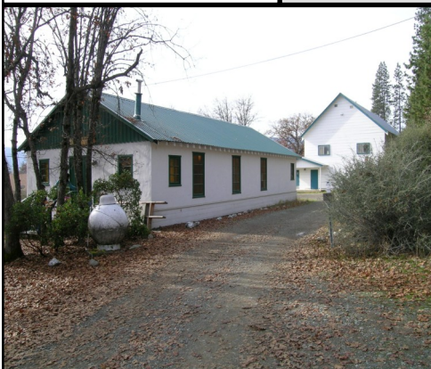
This church in Hayfork uses part of its rectory (the building in back) as a warehouse for collecting and distributing donations to help people in the local community. Churches of all denominations are working together to help those who are in need.