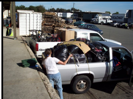
One Family trucks are being loaded at the county reuse center. 175 warm jackets, 159 blankets, 26 sleeping bags, 48 pairs of shoes and several bags of clothing are destined for communities in Trinity County. The other truck is picking up bikes and children's shoes as part of a shipment being sent to an orphanage in Nicaragua.

With One Family members living near Weaverville and always tuned into helping people in need, it was an easy decision to expand the Rural Poverty program to communities in Trinity County, California where a fourth of the population is living below the poverty line. There One Family members witnessed once again how important a warm blanket can be as people carried them away beaming as if they had just received a treasure.