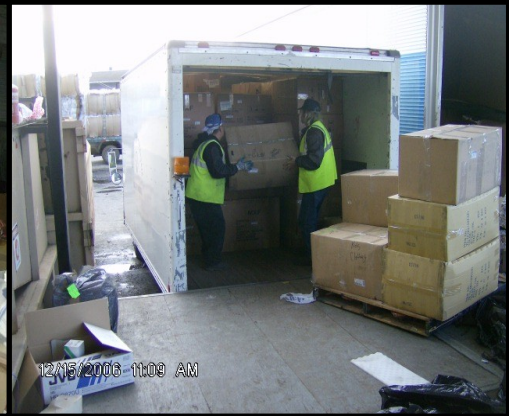
Pacific Rim employees are loading a truckload of blankets and warm clothing in Benicia. This shipment was taken to Stockton and completely distributed in less than a week. More is needed and much of it will be provided through the county reuse program.