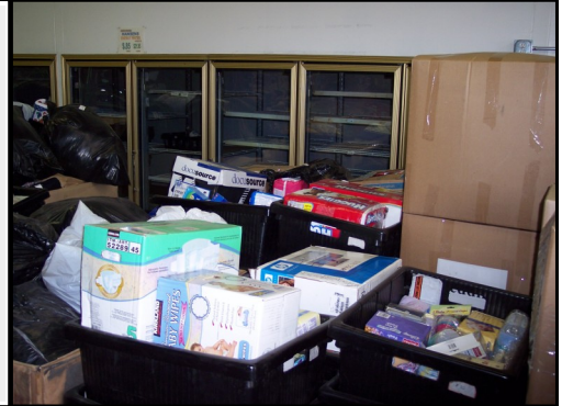
Diapers, hygiene supplies, cleaning materials, bedding and clothing donated by generous people in Oregon helped fill this 53 foot truck

With help from St. Vincent DePaul in Lane County Oregon, Pacific Rim Recycling, The East Bay Depot for Creative Reuse, a number of volunteers and with financial donations to help with shipping, One Family was able to collect, pack and ship quality relief aid very quickly.