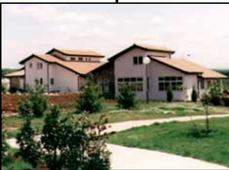
The orphanage is designed to reproduce a family living environment for the children to help them recover quicker.