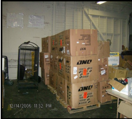
Incoming reusable items are sorted and packed into boxes for easier distribution. Here a shipment destined for Stockton is being organized on pallets at the Benicia facility.