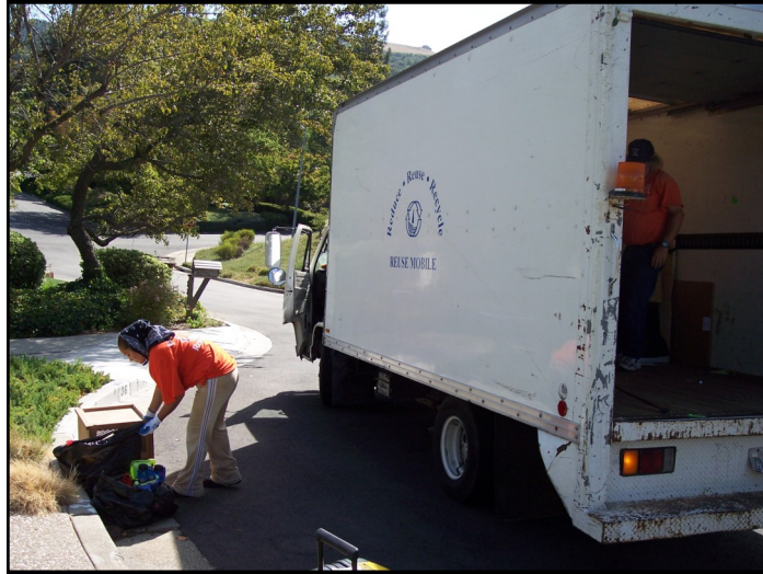
The truck and employees of Pacific Rim Recycling follow a daily route that will eventually take them past every house in Central Contra Costa County twice a year.