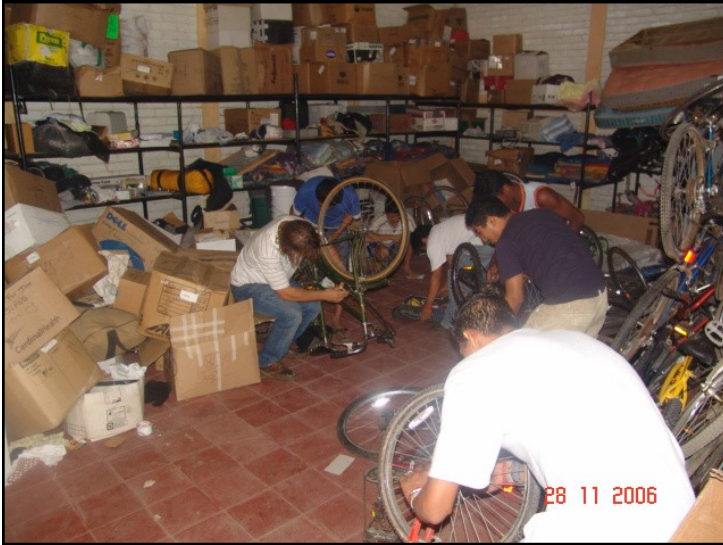
Employees from Pacific Rim Recycling and the East Bay Depot for Creative Reuse help load bikes into the container. With each bike it is easy to imagine the happiness it will bring the child who will be riding it.

Bicycle Repair Centers The bikes are repaired by the staff and students at the orphanage. All parts, tools for repairing the bikes (including an air compressor) and repair manuals are shipped. At one time One Family volunteers repaired all bikes before sending them. As you can imagine it was a very labor intensive, time consuming project and it made it difficult to plan shipment dates. We asked the administrators at the orphanages if they would be interested in setting up repair centers and use them to teach bicycle repair to the students. It's one more useful skill for these young people to develop. The program in Nicaragua has been a resounding success which has led to repair centers being started in Honduras and El Salvador. Over 500 bicycles from the county reuse program have been shipped to these countries in the past two years.